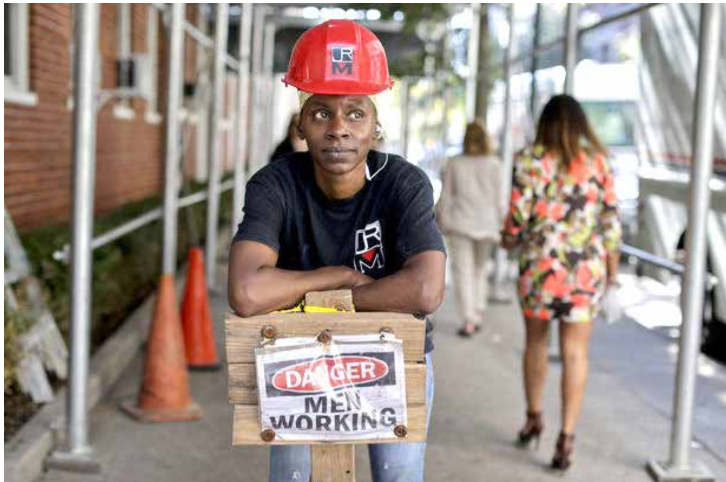
Women make up about 3 percent of all construction workers and 2.3 percent of apprenticeships in the construction trades, according to a report released today, December 11, 2014, by the Institute for Women's Policy Research and Jobs for the Future.